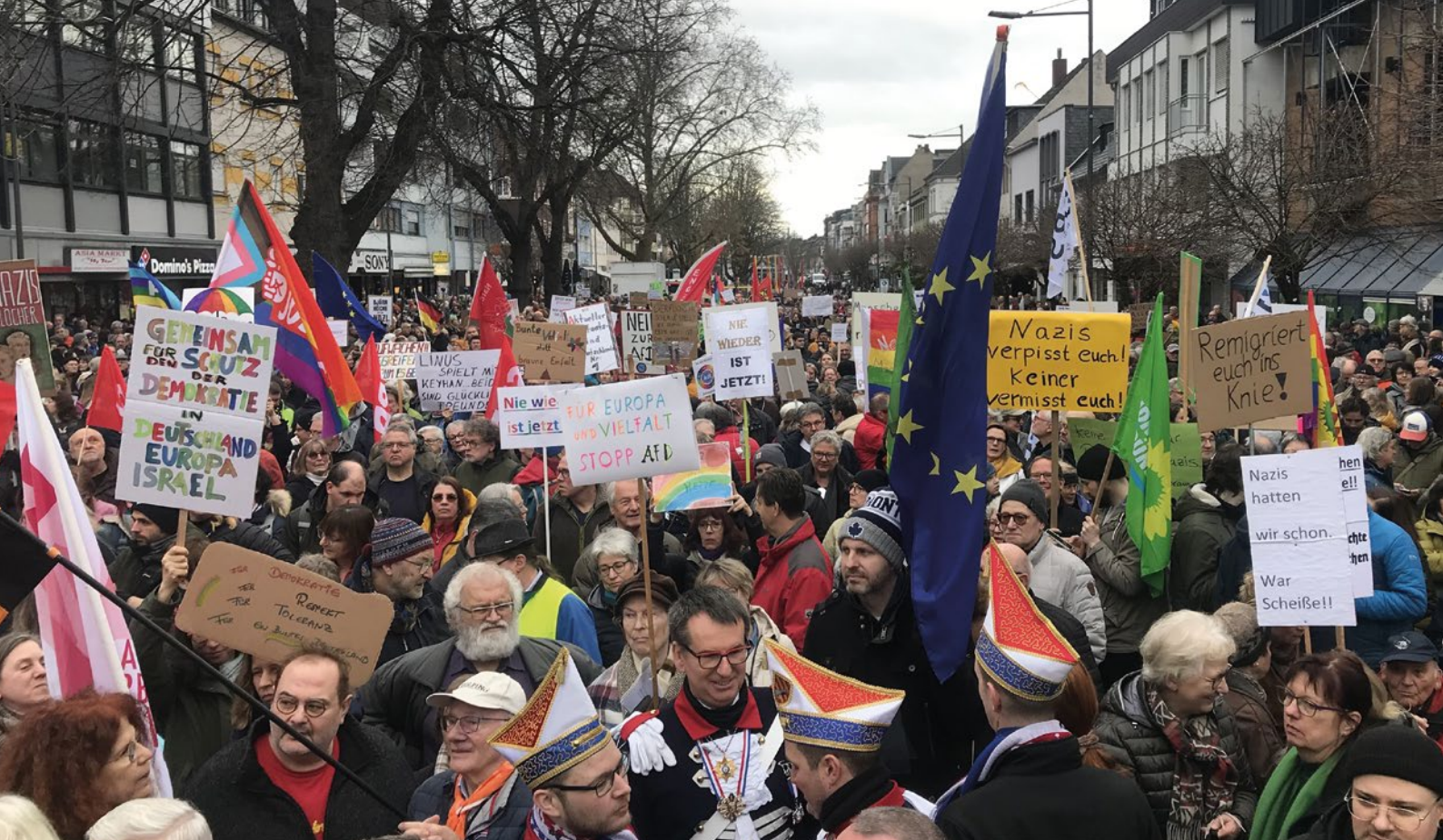
Civil society's non-violent activism in Neuwied: During the Neuwied Carnival in February 2024, local residents protested against the rise of right-wing populism and the growing influence of the AfD in Neuwied.

responsibility whatsoever for the content published, are therefore incompatible with this approach. Wikipedia, on the other hand, is an example of how controversial topics can be handled responsibly in the digital sphere.