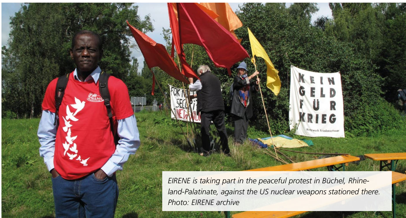
EIRENE is taking part in the peaceful protest in Büchel, Rhineland-Palatinate, against the US nuclear weapons stationed there.

Our task in the current climate, in which the hegemonic power of the USA is withdrawing from Europe and China and Russia are attempting to exert influence over us, is to practise a form of coexistence based on human rights, extending right into the digital realm. Platforms such as Facebook, which give space to fake news and accept no