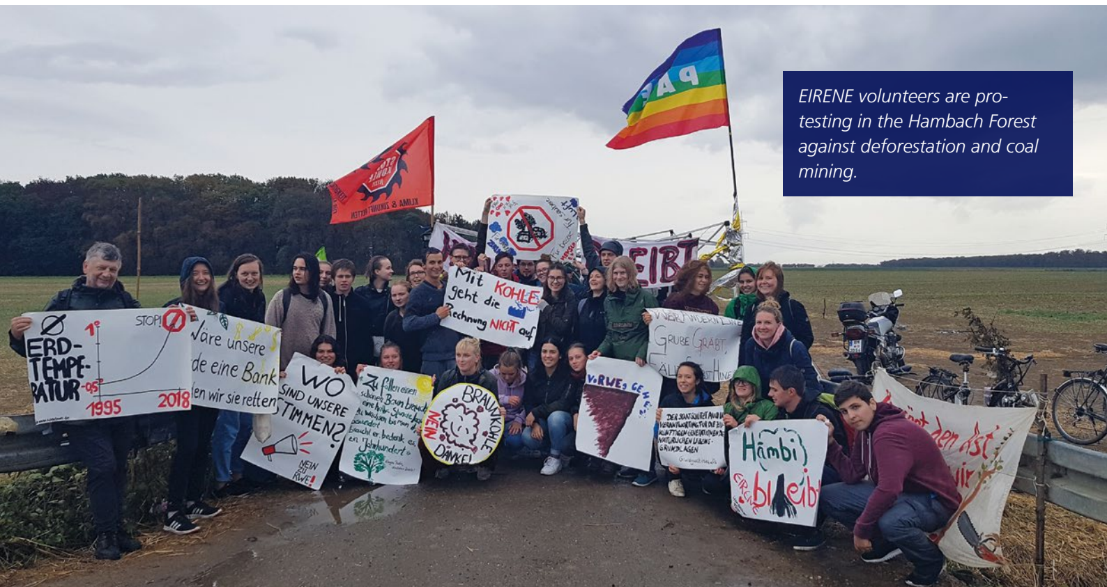
EIRENE volunteers are protesting in the Hambach Forest against deforestation and coal mining.

Development, diplomacy and peace are therefore more closely intertwined than ever before. Effective peace and development work arises precisely from the interaction between state and civil society actors and operates within the tension between idealism and practicality.