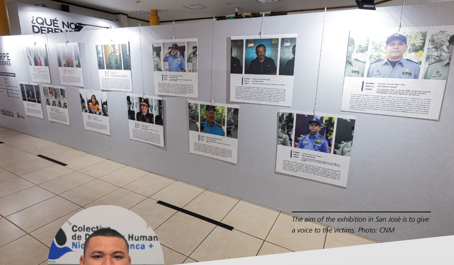
The aim of the exhibition in San José is to give a voice to the victims.