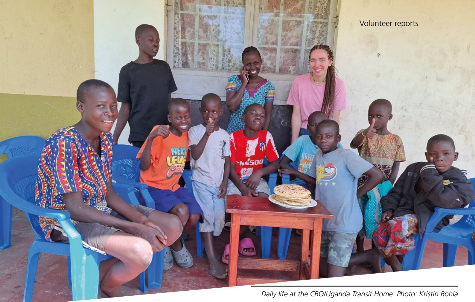
Daily life at the CRO/Uganda Transit Home.

What particularly concerns me is that many problems are structural. Reintegration fails not because of a lack of will, but because of poverty, overwhelming demands and a lack of support. Government regulations prevent long-term solutions. Education remains out of reach for many. When five out of ten children end up back on the streets after reintegration, it often feels frustrating, and at the same time it makes it clear that this is about more than just individual fates. Nevertheless, I also see hope. At CRO, it is not just about provision, but about dignity and prospects. In small projects, the children learn practical skills, such as baking or a trade. These are small steps, but they mean self-efficacy and a future.